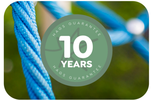
Steel Core Rope