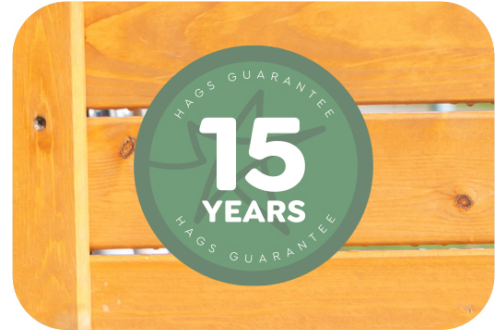
Nordic Pine Wood