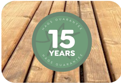
Thermally Treated Nordic Pine Wood