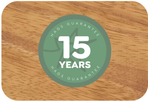
FSC Certified Hardwood