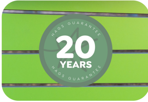
High Pressure Laminate (HPL)